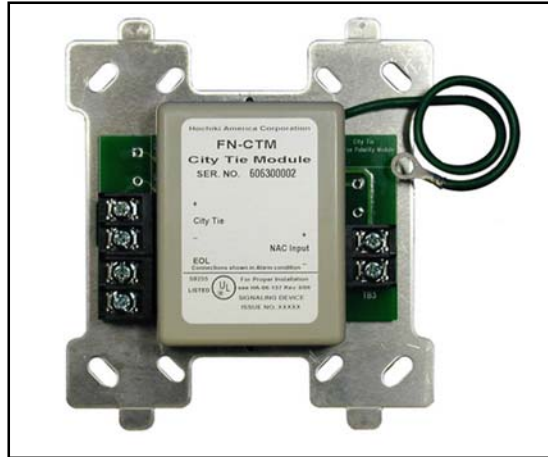
Rear view of FN-CTM City Tie Module

The contractor shall furnish and install where indicated on the plans, the Hochiki America FN-CTM City Tie Module. The module terminal blocks shall be capable of accepting up to 14 AWG wire. The FN-CTM shall be configured such that the Fire Alarm Control Panel's EOL (end of line) device connects directly with the FN-CTM to ensure supervision of the interface wiring. The module shall fit into a standard 4" electrical back box. The FN-CTM shall be Underwriter's Laboratories Listed for the intended purpose.